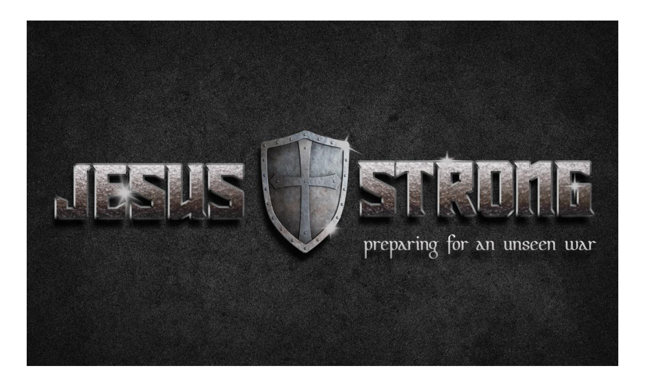
Eph 6:13-14, ESV – <sup>13</sup> Therefore take up the whole armor of God, that you may be able to withstand in the evil day, and having done all, to stand firm. <sup>14</sup> Stand therefore, having fastened on the belt of truth, and having put on the breastplate of righteousness,